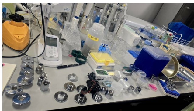
図 1. 関東学院大学 理工学部理工学科 マイクロプラスチック検出研究室にて

I have trained at Kanto Gakuin University, focusing on microplastic, which can affect human health through both consuming and inhalation. Many research journals regarding microplastic in disposable cups, plastic kettles, plastic teabags and drinking water have been assigned to conclude and present to professor and team members. In addition, basic laboratory to detect microplastic in tap water such as Nile Red Staining and Fluorescence technique has been trained. I have gain knowledge and experience a lot. Many advance water quality laboratory techniques will be applied to my research, being benefit to Japanese and Thai people. I will do my best.