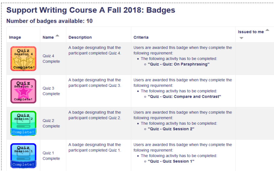
Figure 1. Badges for quizzes of the Support Writing Course A.

badges vary in color and design. For the quiz related badges for the Support Writing Course A as shown in Figure 1, the colors and motifs are the most noticeable aspect of the set. The colors range from cool blue and green for the first two initial designs and then transition to warmer colors for the latter two, implying that the participant is “getting warmer“ i.e. they are getting closer to completing the course. The motifs for the quizzes between courses are also different as shown in Figure 2. The badge design for the Support Writing Course A for example is a computer, hinting at the context of the quiz, whereas the badge for the Follow-up course is a medal. There are also instances where the motifs change as the participant progresses such as the size of the trophy and the number of stars as shown in Figure 3 for the writing assignment badges. Gradually the design becomes more elaborate as the participant progresses in the course and earns more badges as shown in Figure 4. This aesthetic quality can be appealing to the participants and seem to prompt engagement.