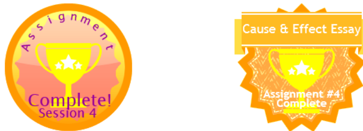
Figure 4. Detail of assignment 4 badge for the Support Writing Course A and the Support Writing Course Follow-up.