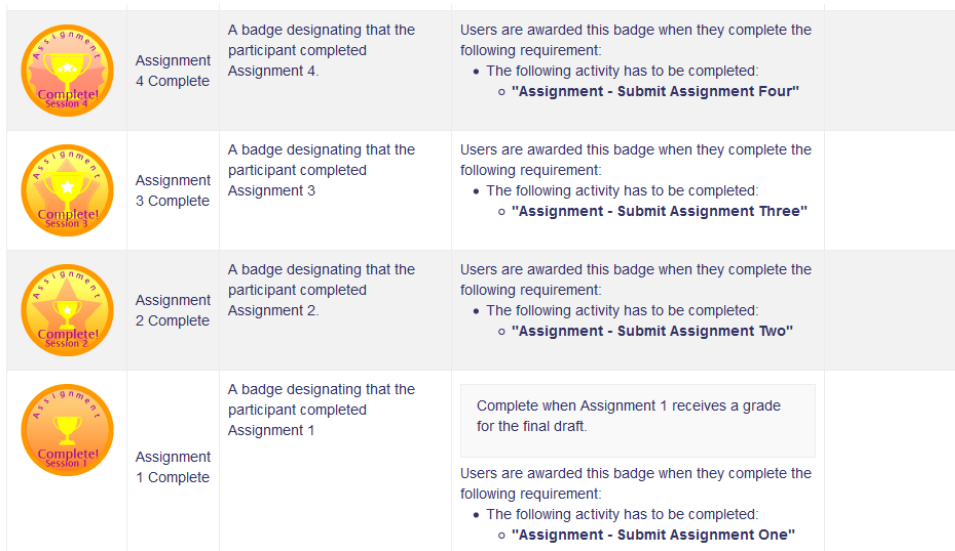
Figure 3. Badges for writing assignment in the Support Writing Course A.