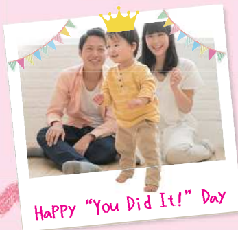
HAPPY "You Did It!" Day

Have fun recording the day's memories along with growth records!