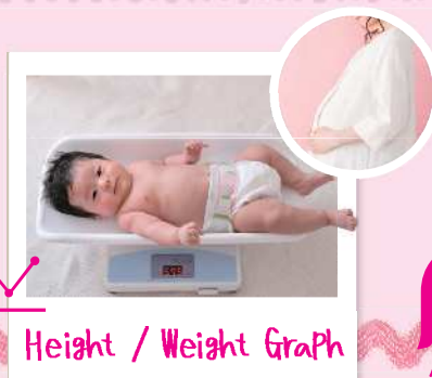
Height / Weight Graph

Every day brings new achievements and reasons to celebrate! Keep a record of your child's new achievements, such as walking with support, along with photos.