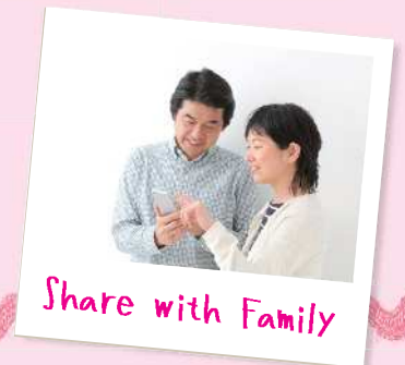
Share with Family

Easily record weight during pregnancy and your child's growth, and automatically graph the data! You'll be able to see how much they've grown at a glance.